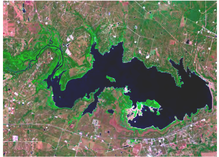
Choke Canyon, August 15, 2013, 37 % full